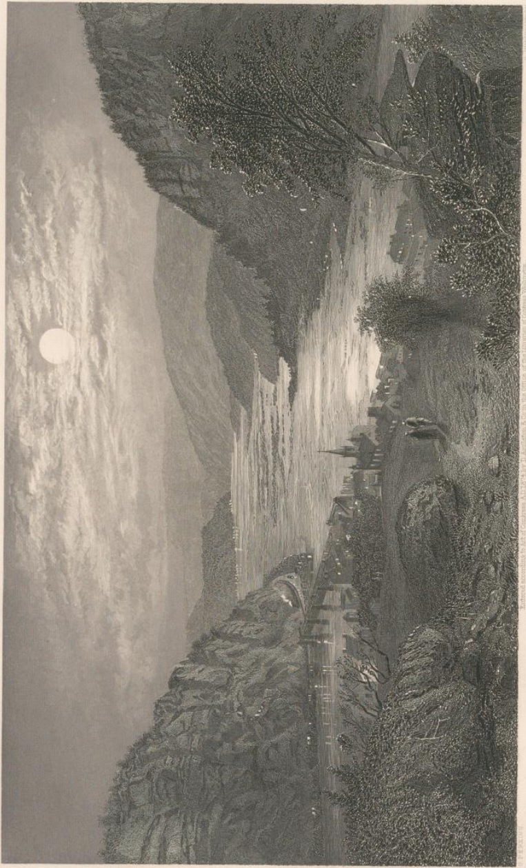
Shavers Ferry by Moonlight