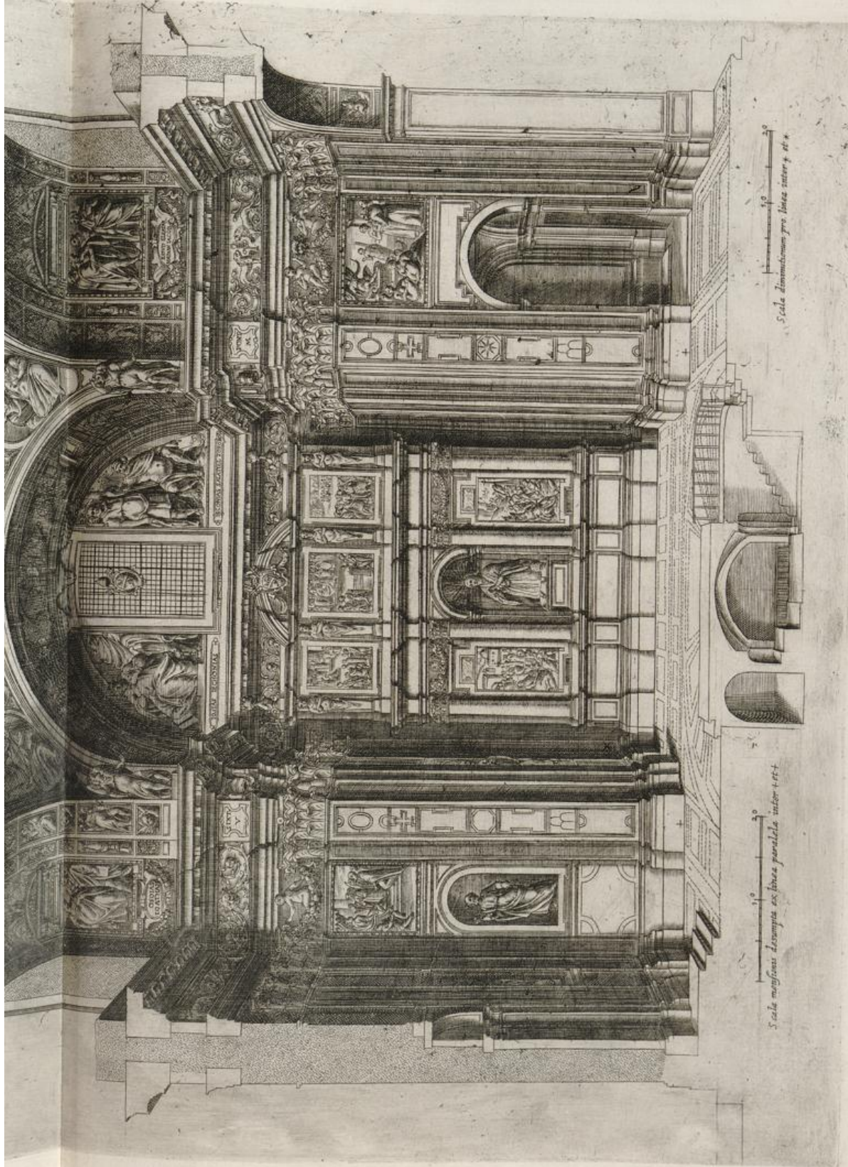
Sala dimmichiana pro linea interior + et +