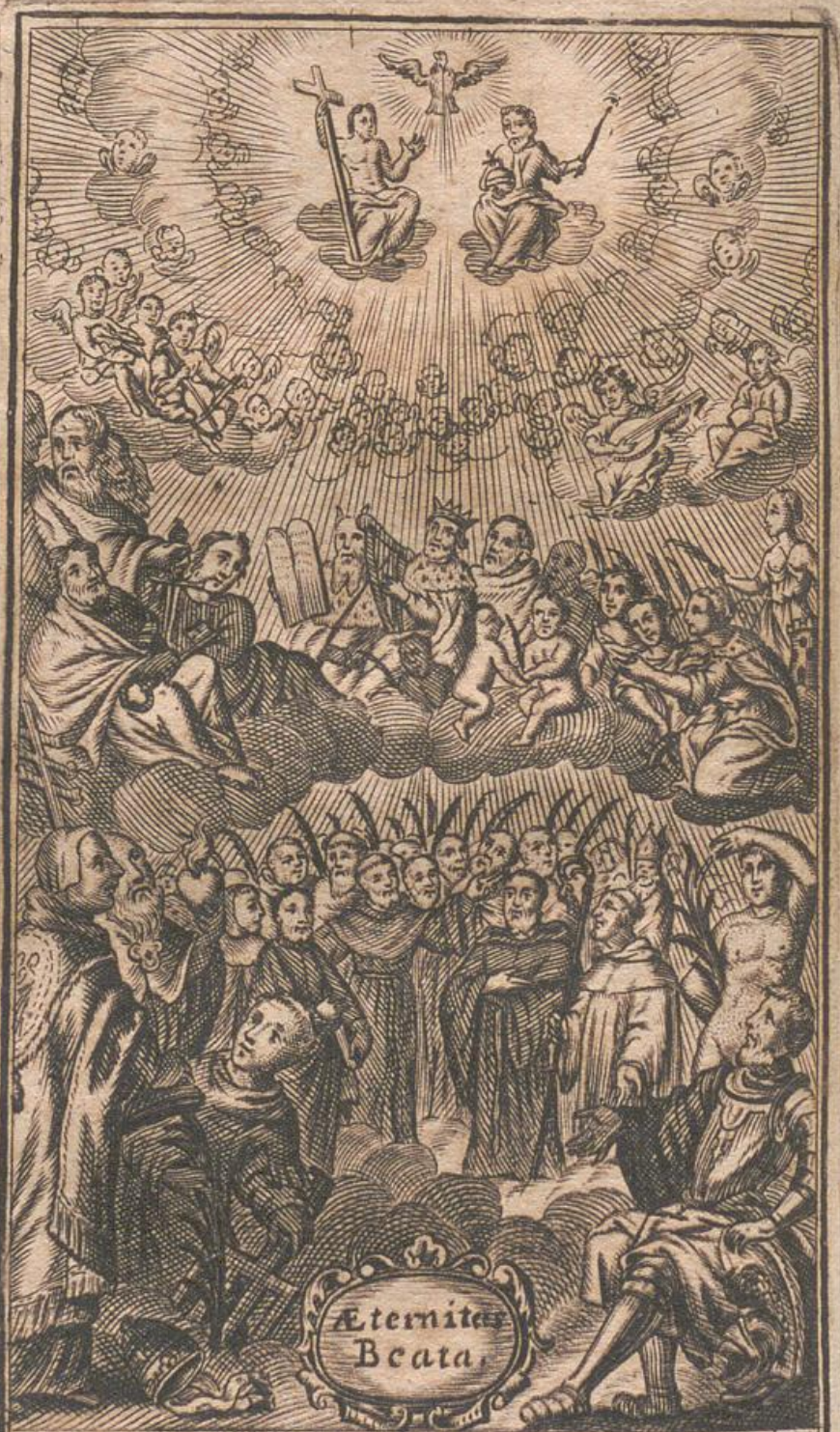
Beati, qui Habitant in domo tua Domine, psal. 83.