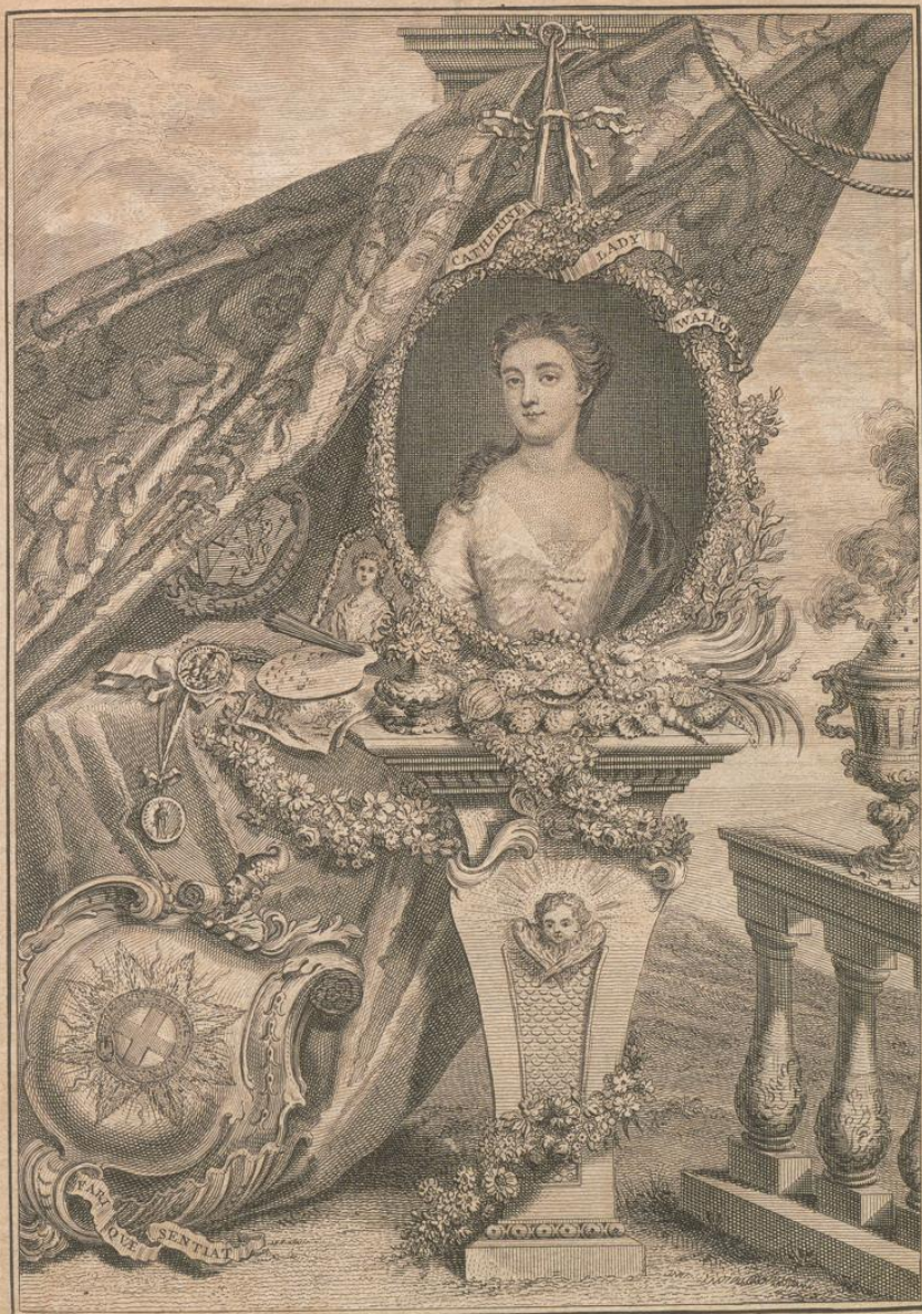
E. Zinke offig. p. 1735