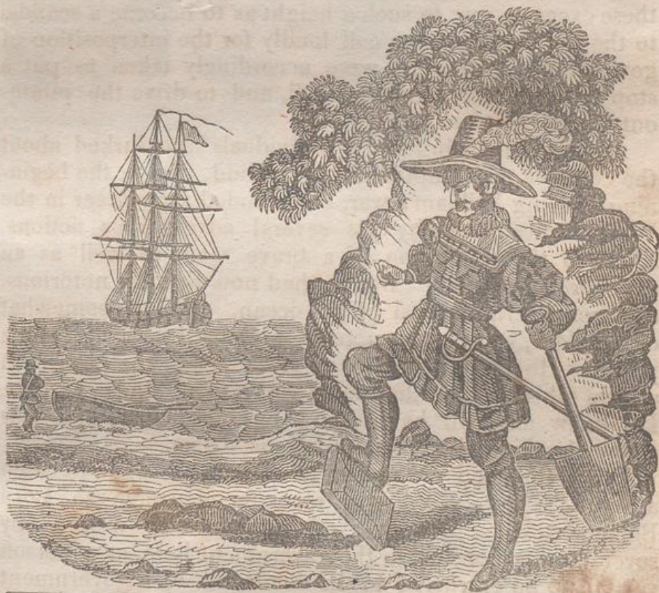
Captain Kidd burying his Bible.

THE easy access to the harbor of New-York, the number of hiding-places about its waters, and the laxity of its newly organized government, about the year 1695, made it a great rendezvous of pirates, where they might dispose of their booty and concert new depredations. As they brought