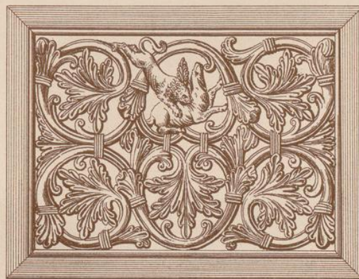
Elfenbeinsulptur. — Byzantinischer Styl.