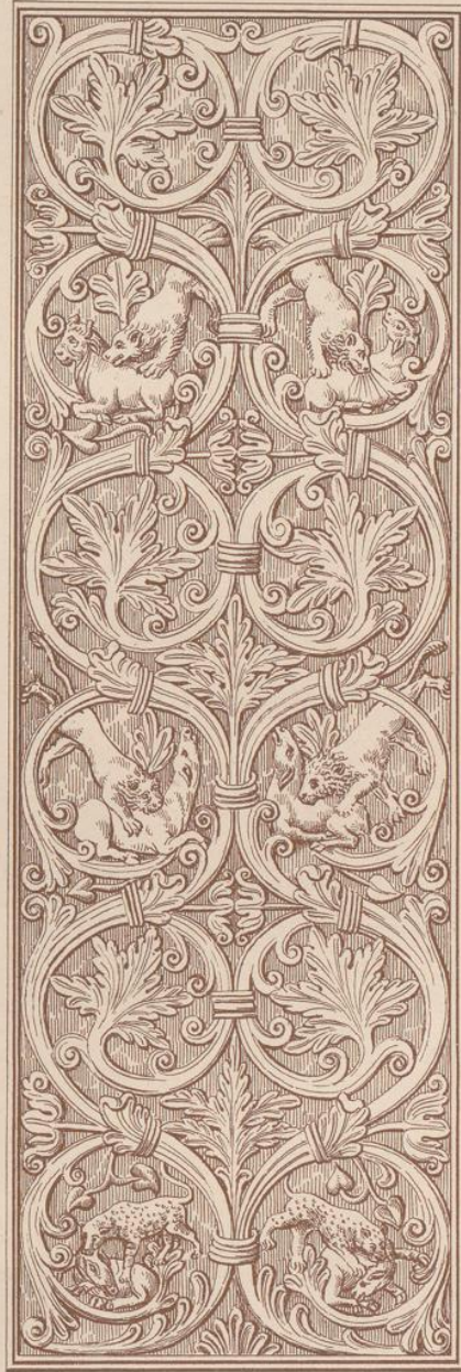
Elfenbein-Tablette. — Byzantinischer Styl.