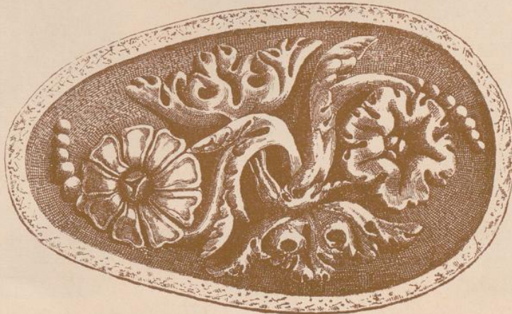
Rosaces ovales. — Style renaissance.