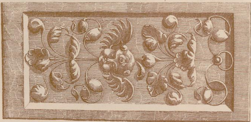
Panneaux en bois sculpté. — Style renaissance.