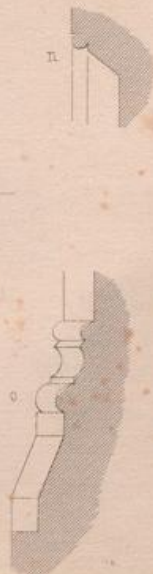
BOGEN D. THÜERE.