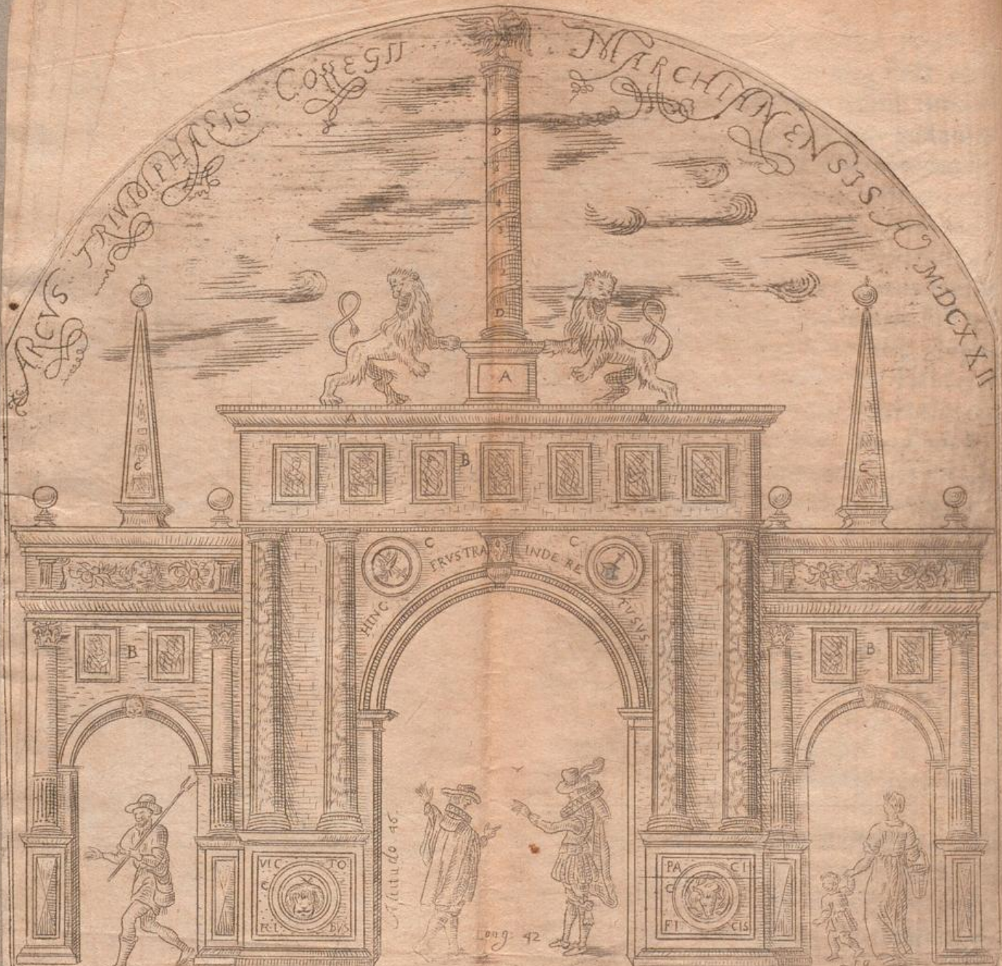
A. Inscriptio. B. Imagines antiquae. C. Symbola rara de utroque. S. D. alia Symbola. Signati in sociis IESV fundat. S. X. a. in. S. a. in. utriusque gella, mortem terrae. C. Alique honores. Inscriptio.