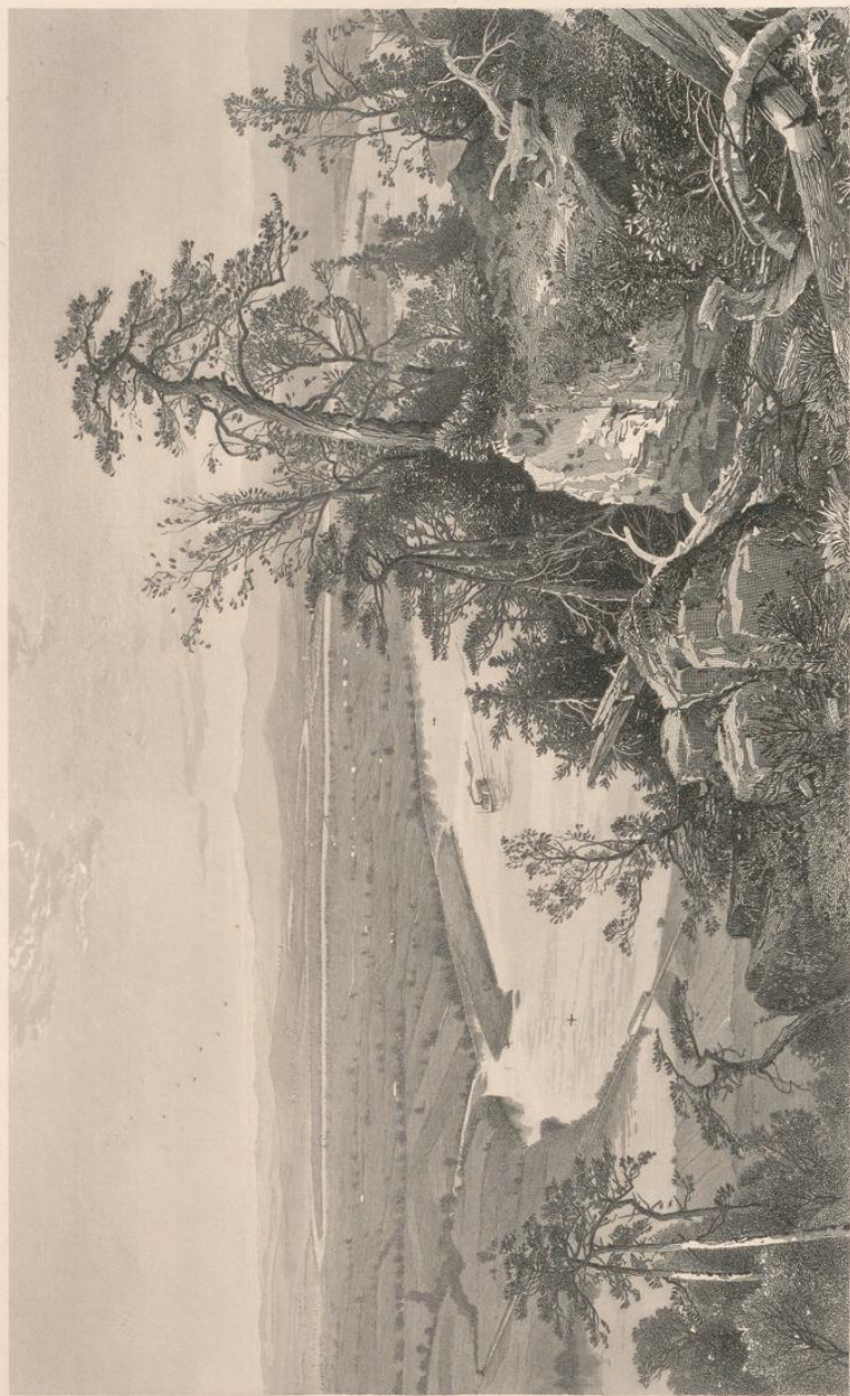
Connecticut Valley from Mount Tom