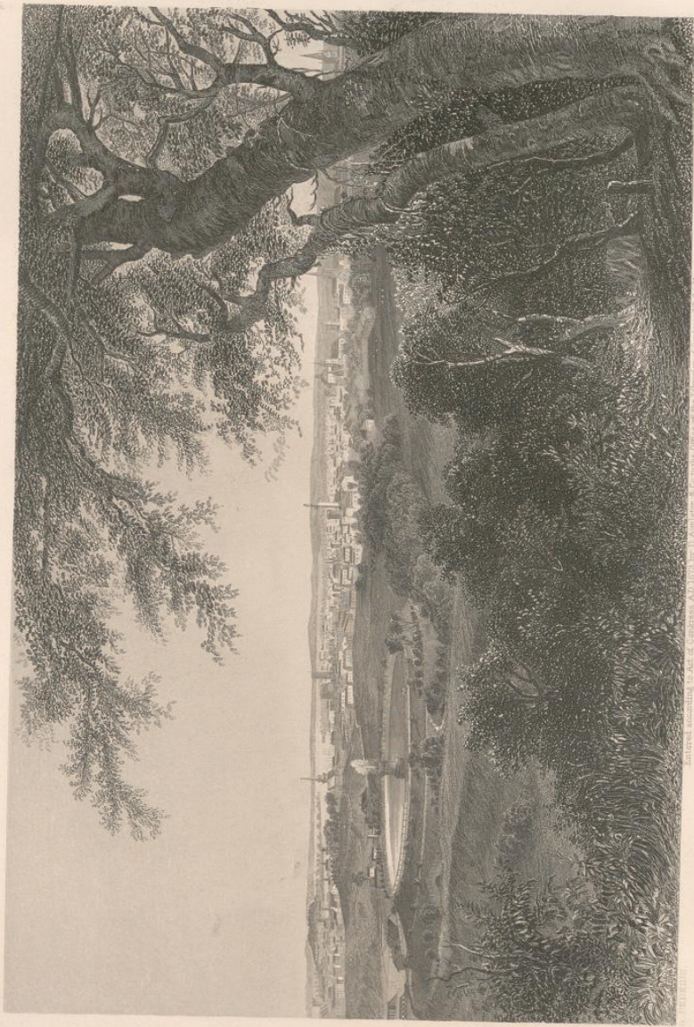
City of Baltimore (FROM DRUID HILL PARK)