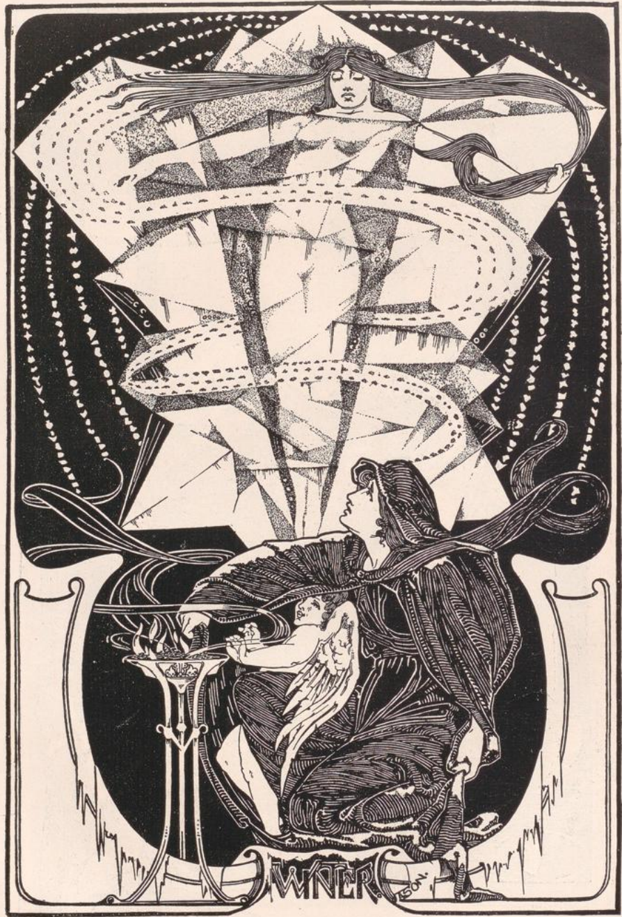
HON. MENTION COMP. B XLVI BY "JASON"