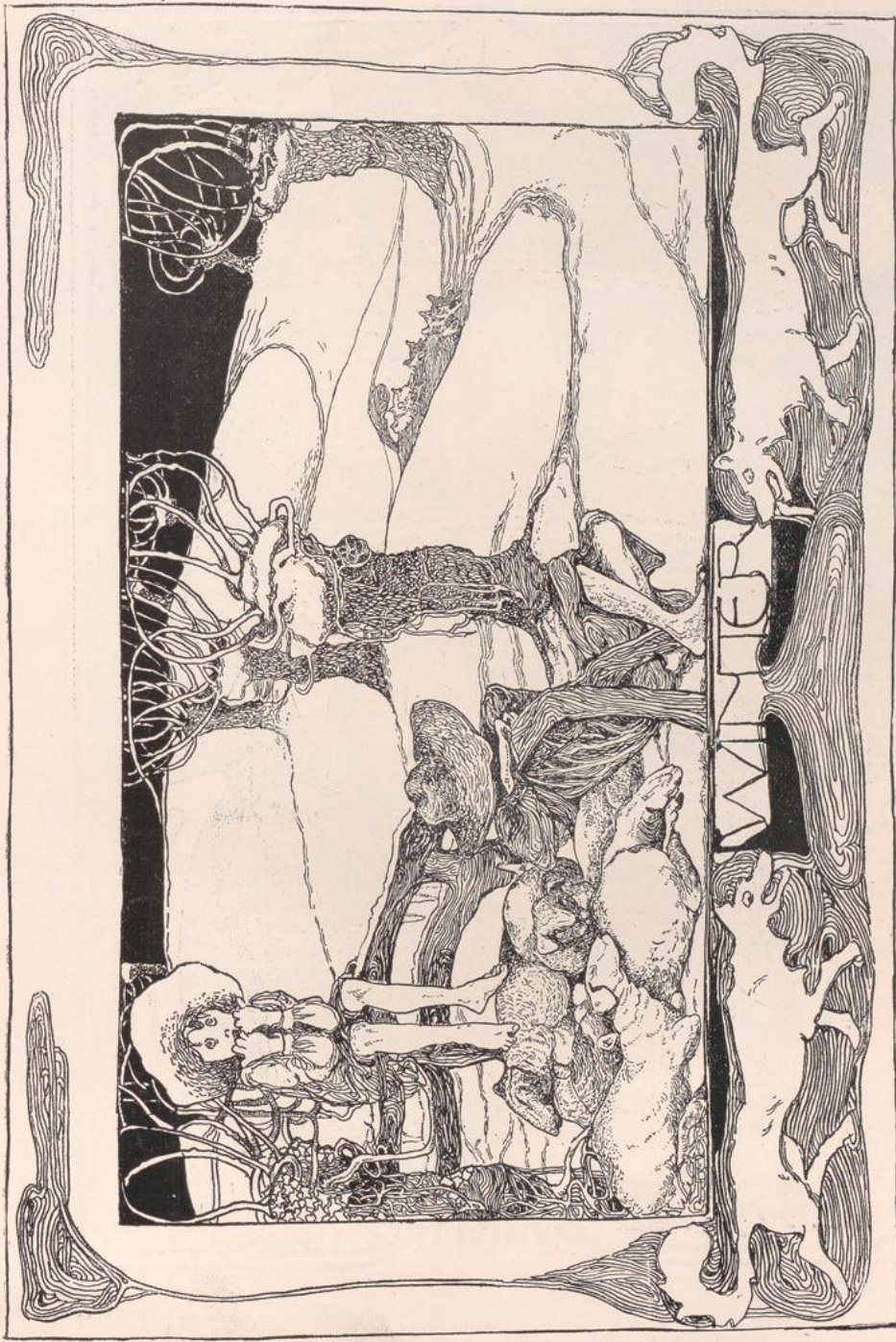
SECOND PRIZE COMP. B XLVI BY "MALVOLIO"