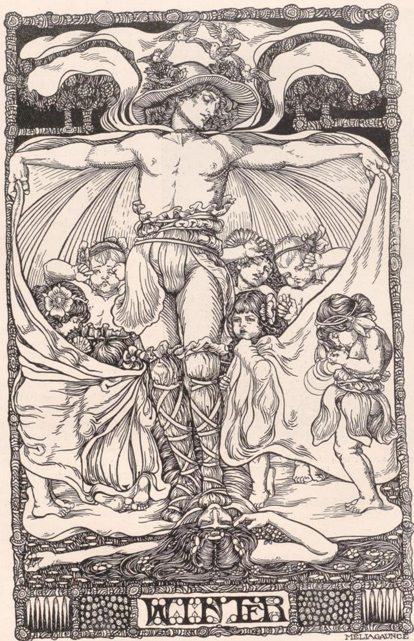
FIRST PRIZE COMP. B XLVI BY "MELIAGAUNCE"