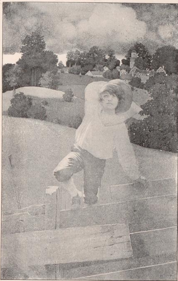
ILLUSTRATION BY MAXFIELD PARRISH FROM "THE GOLDEN AGE" (John Lane)

Disregard to naturalistic lighting is always excusable in decoration; indeed it is doubtful if its extinction be not almost a necessity in all works of such a character. Whether this be admitted or not, Mr. Parrish deals with light as he wants it to be, and not as it is, and the resulting effect is by no means disagreeable. He is most daringly inconsistent, and yet is never offensively so.